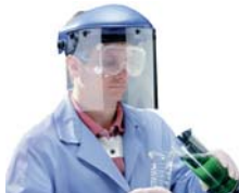
7337 / 7338