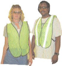
7306 / 7306R