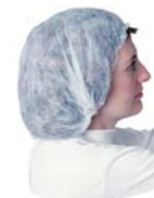
7387W18 / 7387W21 / 7387W24