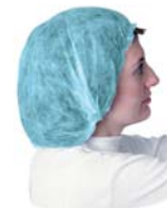
7387B18 / 7387B21 / 7387B24