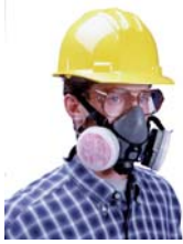
9000 / 9001