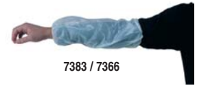
7383 / 7366