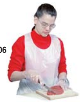
8705 / 8706