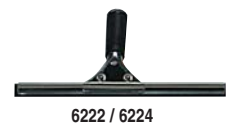
6222 / 6224