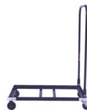
3292T / 2635T